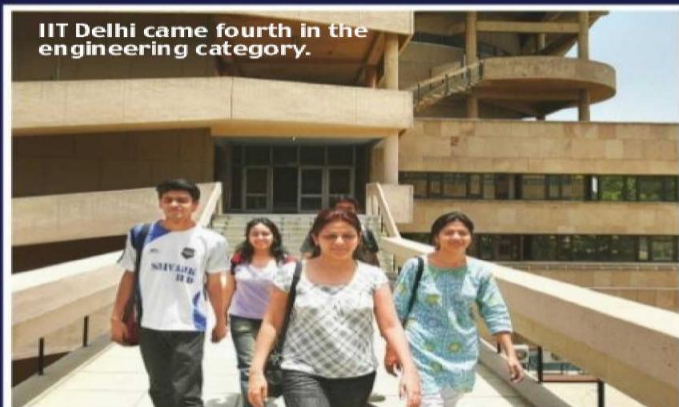
IIT Delhi came fourth in the engineering category.