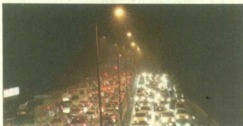
The average speeds, however, increased during the peak traffic hours in the evening.